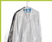
Dry Cleaning Bags